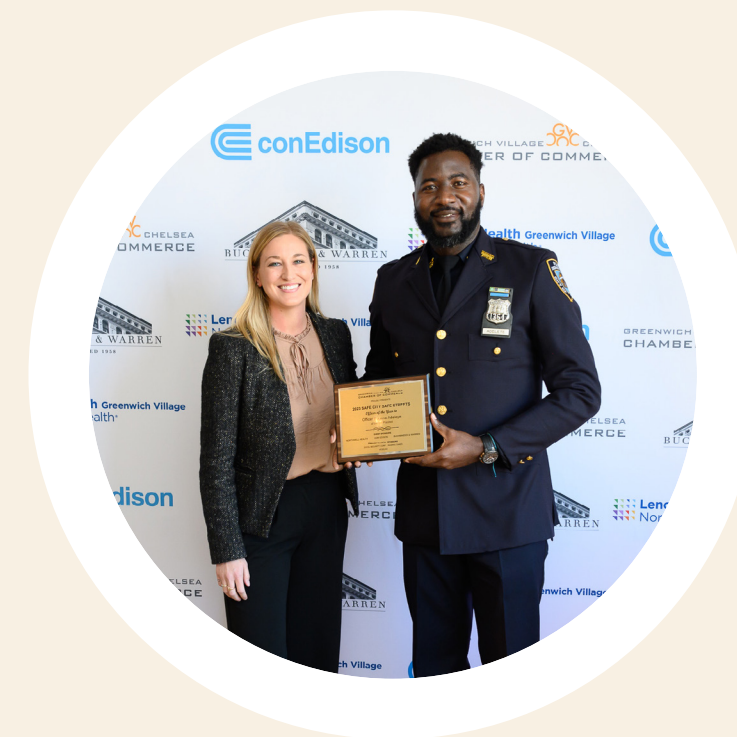
9TH PRECINCT OFFICER OF THE YEAR