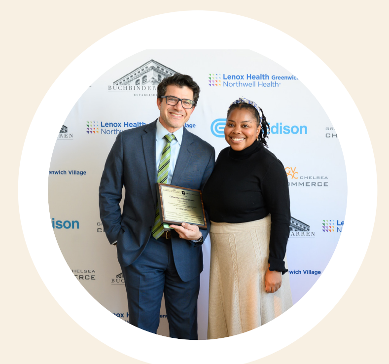
NEIGHBORHOOD LEADERSHIP AWARD