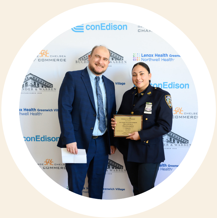
MIDTOWN SOUTH OFFICER OF THE YEAR