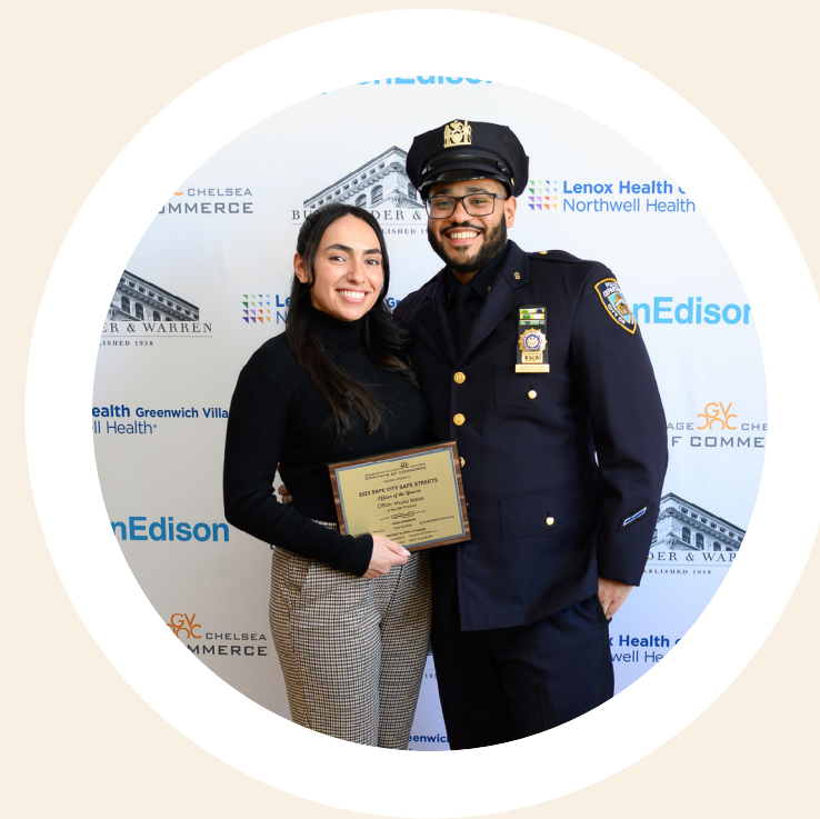
6TH PRECINCT OFFICER OF THE YEAR

These dedicated men and women work tirelessly to ensure the safety and security of our vibrant community. Through their exemplary service and commitment, they uphold the highest standards of law enforcement, fostering a secure and thriving environment for residents and businesses alike. Join us in celebrating their achievements and recognizing their vital contributions to making our city a safer place.