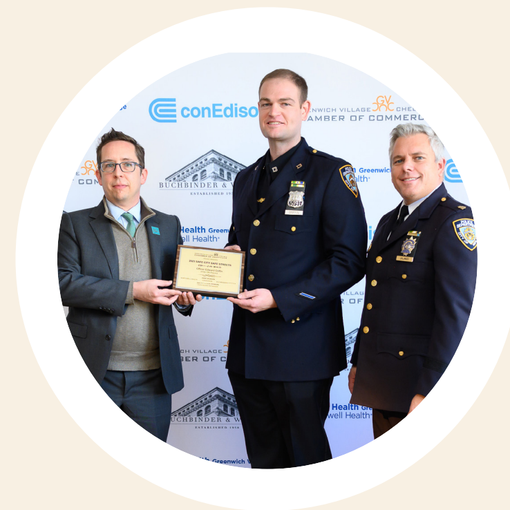
13TH PRECINCT OFFICER OF THE YEAR