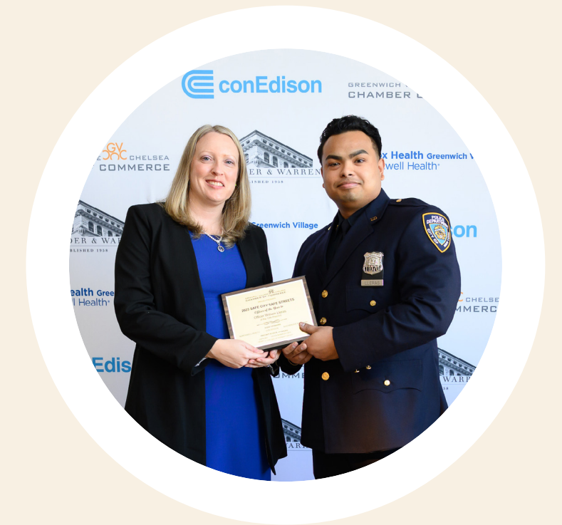
10TH PRECINCT OFFICER OF THE YEAR