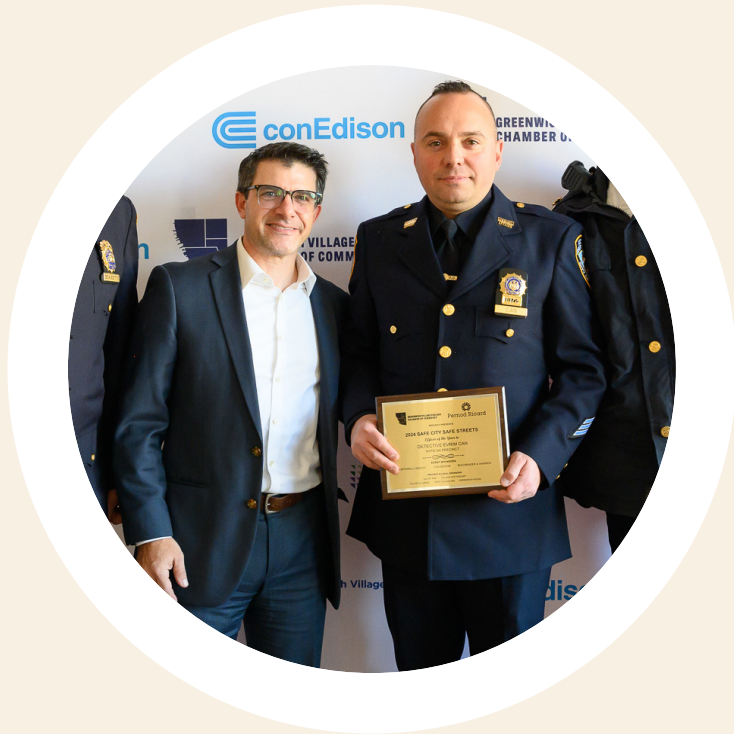
6TH PRECINCT OFFICER OF THE YEAR

These dedicated officers and community leaders work tirelessly to foster a secure, thriving environment for residents and businesses alike. Join us in celebrating their achievements and recognizing their vital contributions to making our city a safer place for all.