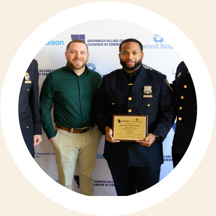
10TH PRECINCT OFFICER OF THE YEAR