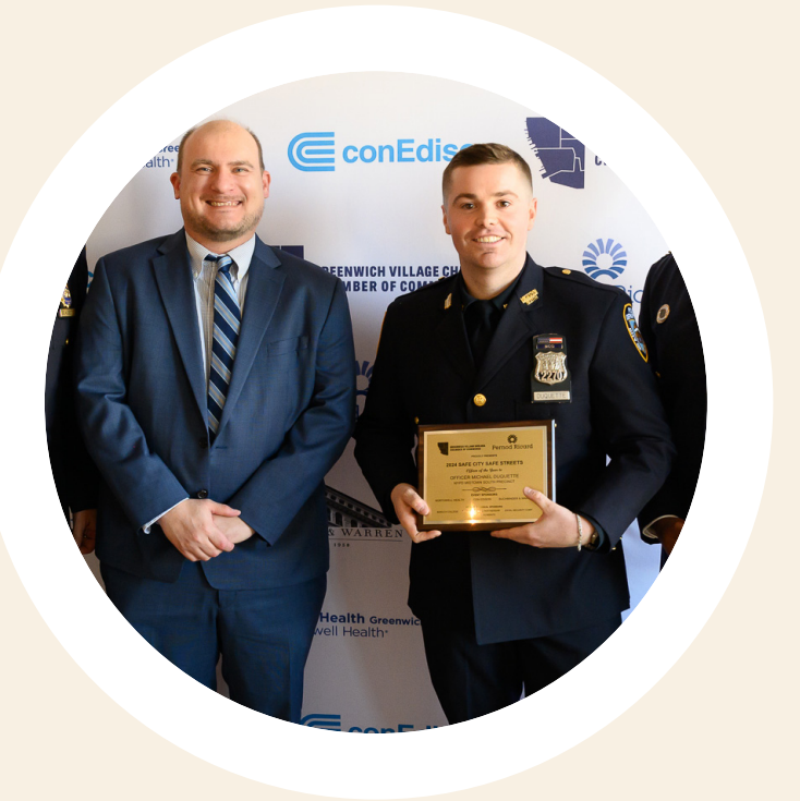
MIDTOWN SOUTH OFFICER OF THE YEAR