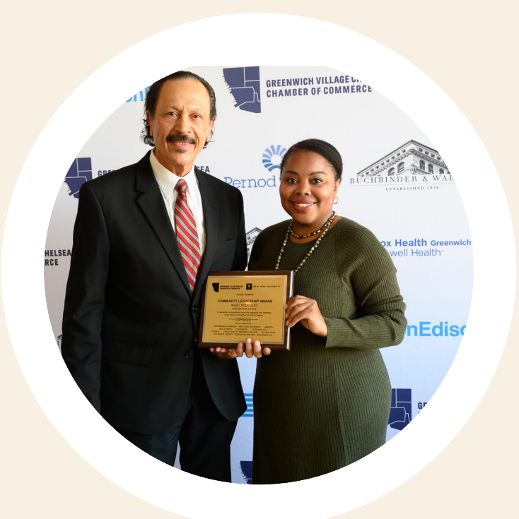
NEIGHBORHOOD LEADERSHIP AWARD