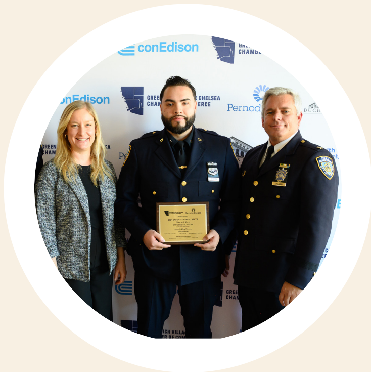
13TH PRECINCT OFFICER OF THE YEAR