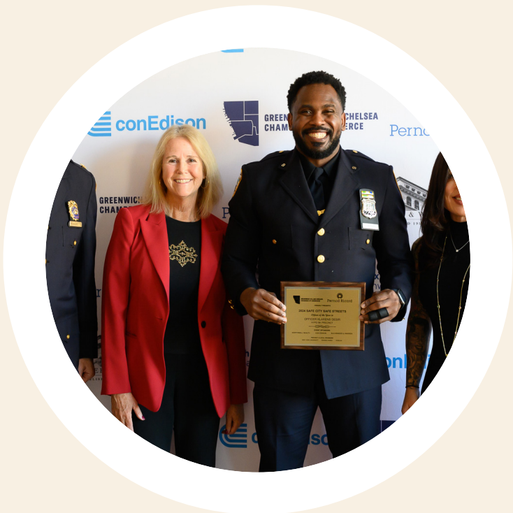
9TH PRECINCT OFFICER OF THE YEAR